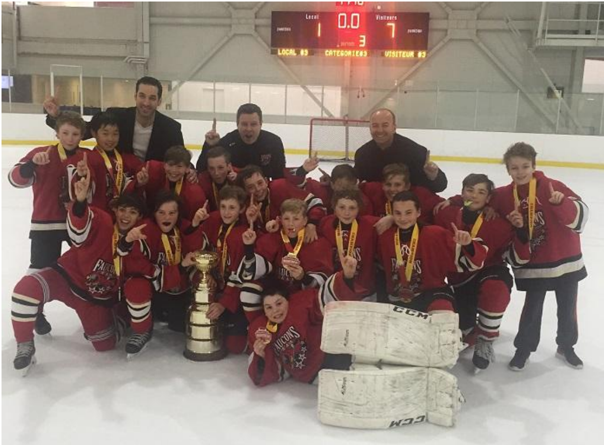
FAUCONS AAA 2004 D3 CHAMPIONS