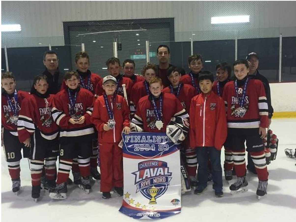
YOUR 2004 D3 FAUCONS ELITES AAA FINALISTS