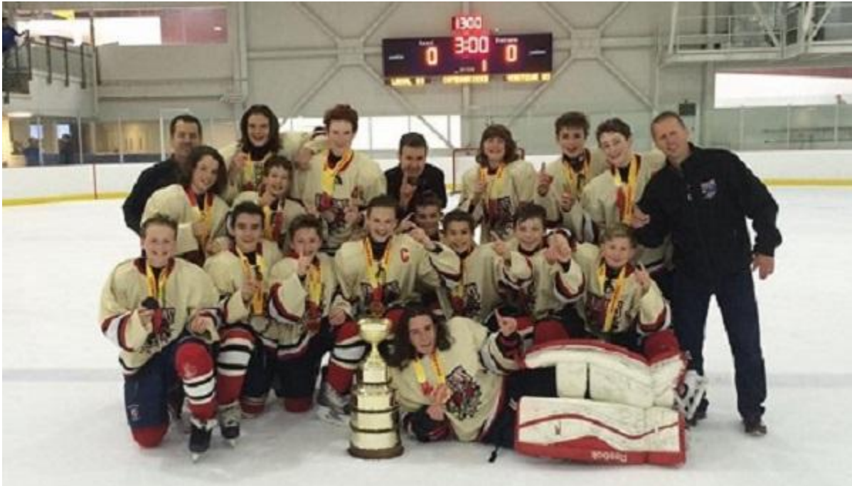
FAUCONS RIVE-SUD 2003 D2 CHAMPIONS