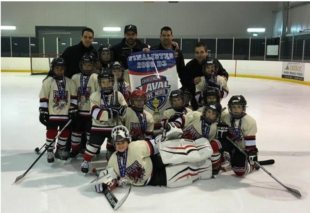
YOUR 2008 D3 FAUCONS ELITES AAA FINALISTS

YOUR FINALISTS - FAUCONS ÉLITES AAA 2008 D3 & 2004 D3 CONGRATULATIONS